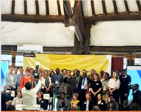
9th To 12th September 2024 Safari Park Hotel, Nairobi Kenya

Participation of the University of Health Science, Somalia