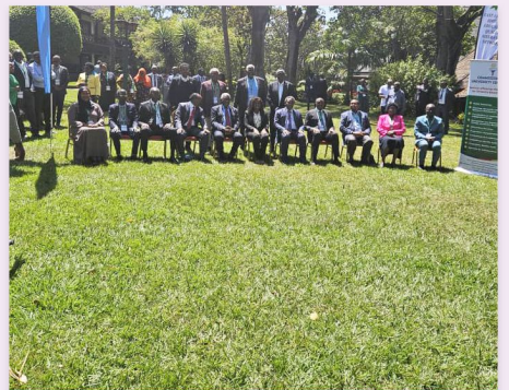
9th To 12th September 2024 Safari Park Hotel, Nairobi Kenya

Participation of the University of Health Science, Somalia