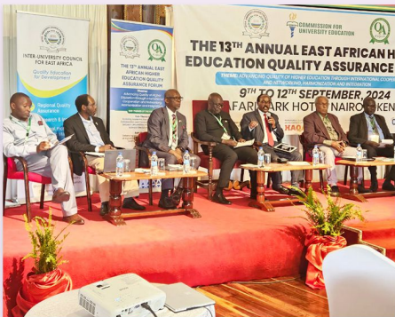
9th To 12th September 2024 Safari Park Hotel, Nairobi Kenya

Participation of the University of Health Science, Somalia