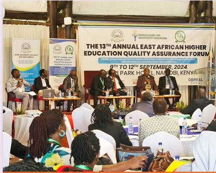
9th To 12th September 2024 Safari Park Hotel, Nairobi Kenya

Participation of the University of Health Science, Somalia