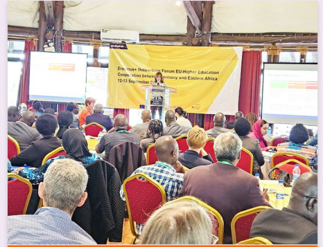
9th To 12th September 2024 Safari Park Hotel, Nairobi Kenya

Participation of the University of Health Science, Somalia