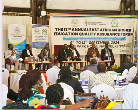
9th To 12th September 2024 Safari Park Hotel, Nairobi Kenya

Participation of the University of Health Science, Somalia